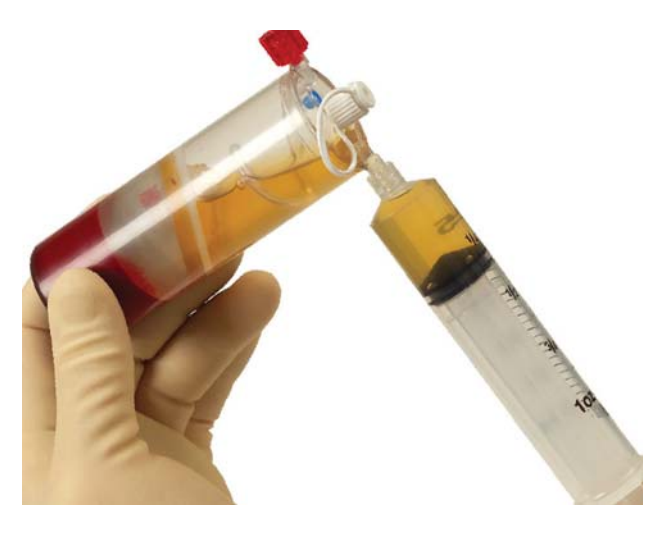
Fig. 4 GPS III system, withdrawing of platelet poor plasma to be discarded

aseptic technique from the anticubital vein. An 18 or 19 g butterfly needle is advised, in efforts of avoiding irritation and trauma to the platelets which are in a resting state. The blood is then placed in an FDA approved device and centrifuged for 15 min at 3,200 rpm (Fig. 3). Afterward, the blood is separated into platelet poor plasma (PPP), RBC, and PRP. Next the PPP is extracted through a special port and discarded from the device (Fig. 4). While the PRP is in a vacuumed space, the device is shaken for 30 s to resuspend the platelets. Afterwards the PRP is withdrawn (Fig. 5). Depending on the initial blood draw, there is approximately 3 or 6 cc of PRP available.