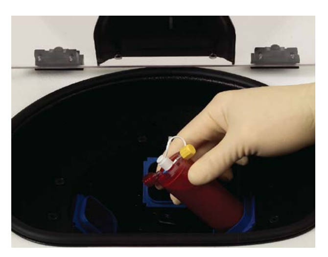
Fig. 3 GPS III system and centrifuge

Various blood separation devices have differing preparation steps essentially accomplishing similar goals. The Biomet Biologics GPS III system is described here for simplicity. About 30–60 ml of venous blood is drawn with