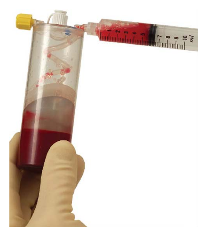
Fig. 5 GPS III withdrawing of platelet rich plasma for injection/graft

and radiographs. It is recommended to use dynamic musculoskeletal ultrasound with a transducer of 6-13 Hz in an effort to more accurately localize the PRP injection. Under sterile conditions, the patient receives a PRP injection with or without approximately 1 cc of 1% lidocaine and 1 cc of 0.25 Marcaine directly into the area of injury. Calcium chloride and thrombin may be added to provide a gel matrix for the PRP to adhere to, potentially maximizing the benefit in the case of a joint space. We recommend using a peppering technique spreading in a clock-like manner to achieve a more expansive zone of delivery. The patient is observed in a supine position for 15-20 min afterwards, and is then discharged home. Patients typically experience minimal to moderate discomfort following the injection which may last for up to 1 week. They are instructed to ice the injected area if needed for pain control in addition to elevation of the limb and modification of activity as tolerated. We recommend acetaminophen as the optimal analgesic, or Vicodin for break through pain, and dissuade the use of NSAID's in the early post-injection period (Fig. 6).